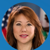
Fiona Ma, CPA California State Treasurer

We welcome you to the CalABLE community, and hope you find this guide helpful.